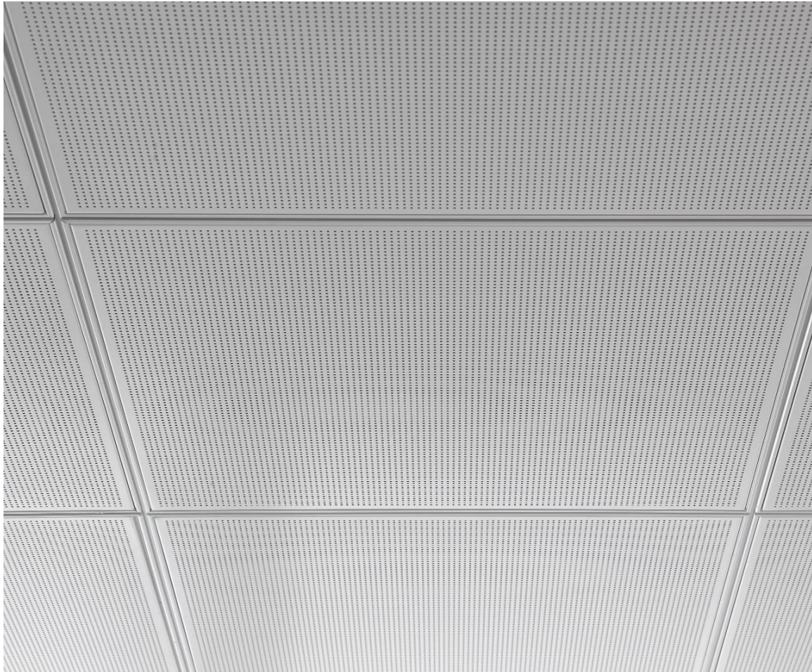
Metal Ceiling System SAS130 – Aluminium CPC Code 42190

EPDs of construction products may not be comparable if they do not comply with the BS EN15804:2012 standard