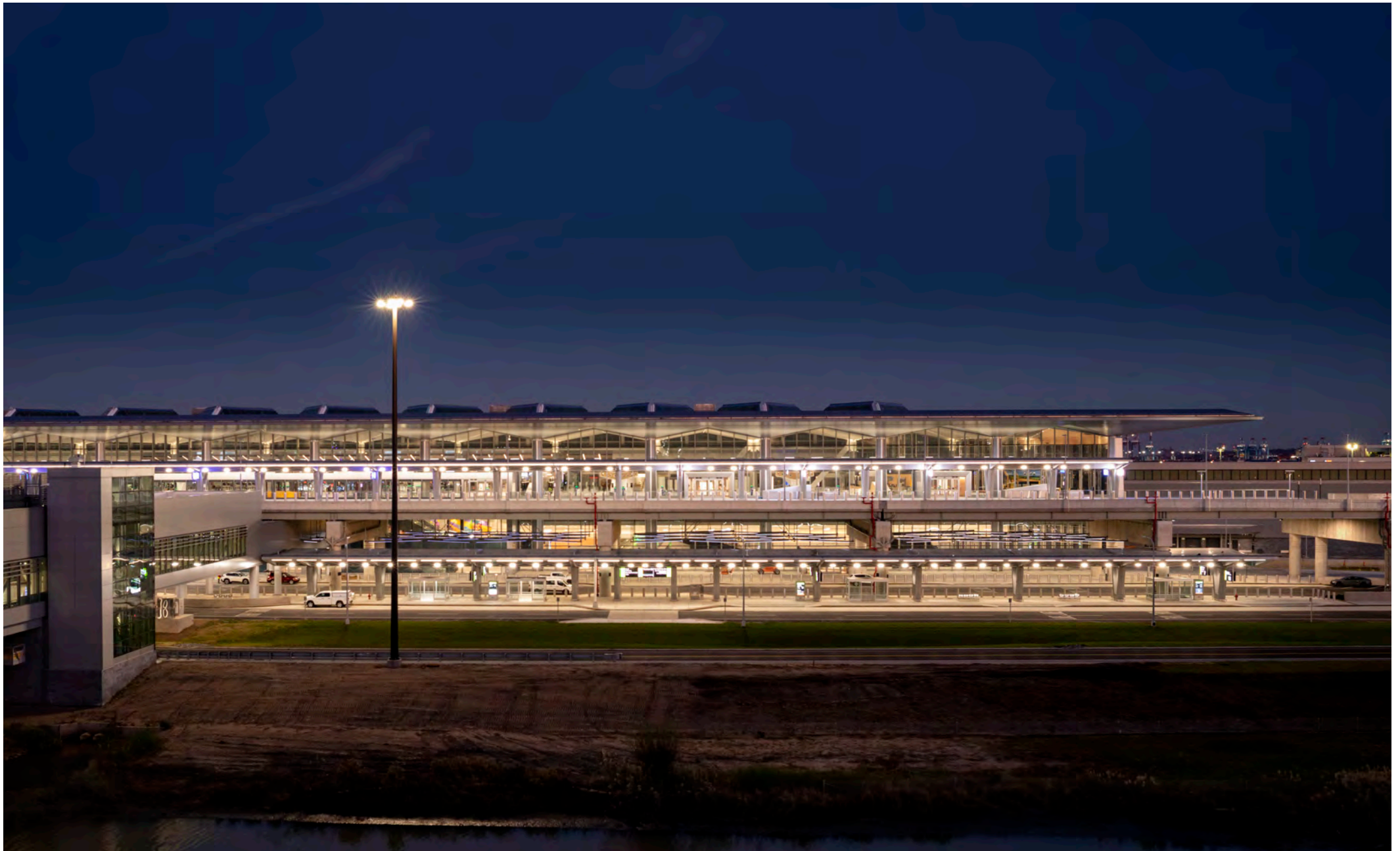
This stunning new addition to Newark's Liberty International Airport is the new Terminal A. It was constructed to the south of the previous Terminal A, providing a 33-gate common use terminal over 1,000,000 square feet.